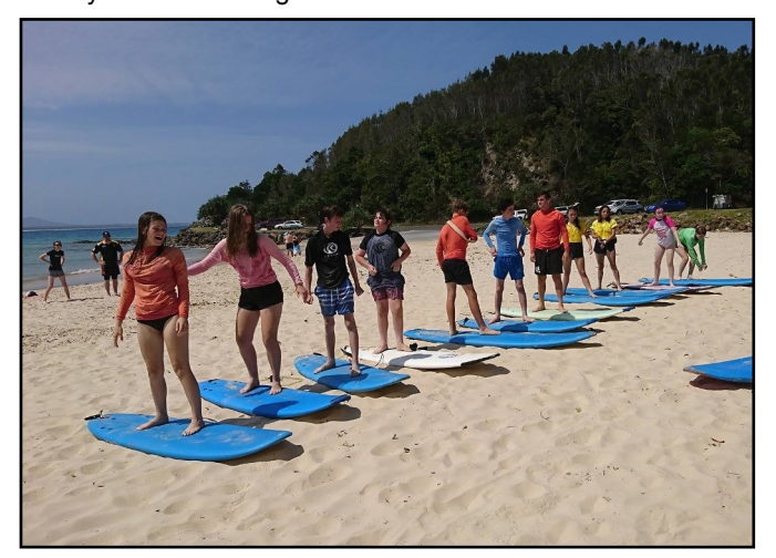
Learning to surf