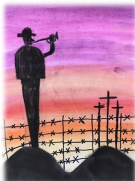
Commemorating our Anzacs