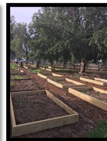
Year 8 Agriculture Students have been busy building new Vegetable Patches.