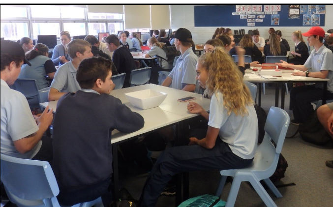
Students enjoying the rewards afternoon